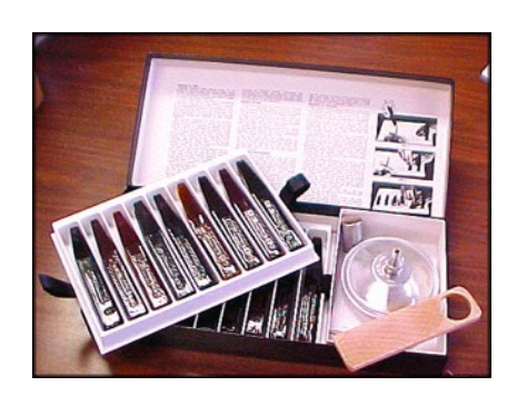
Dennison Standard Paper Testing Wax Kit (full test kit)